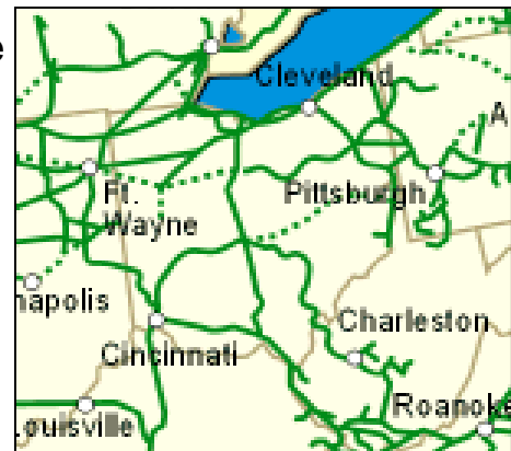
Norfolk Southern System Map

© COMPETITION: Three railroads show service availability along the east-west line. A regional railroad, the Ohio Central Railroad, is the primary service provider. Mainline carriers, Norfolk Southern and CSXT, also show service availability on their system maps.